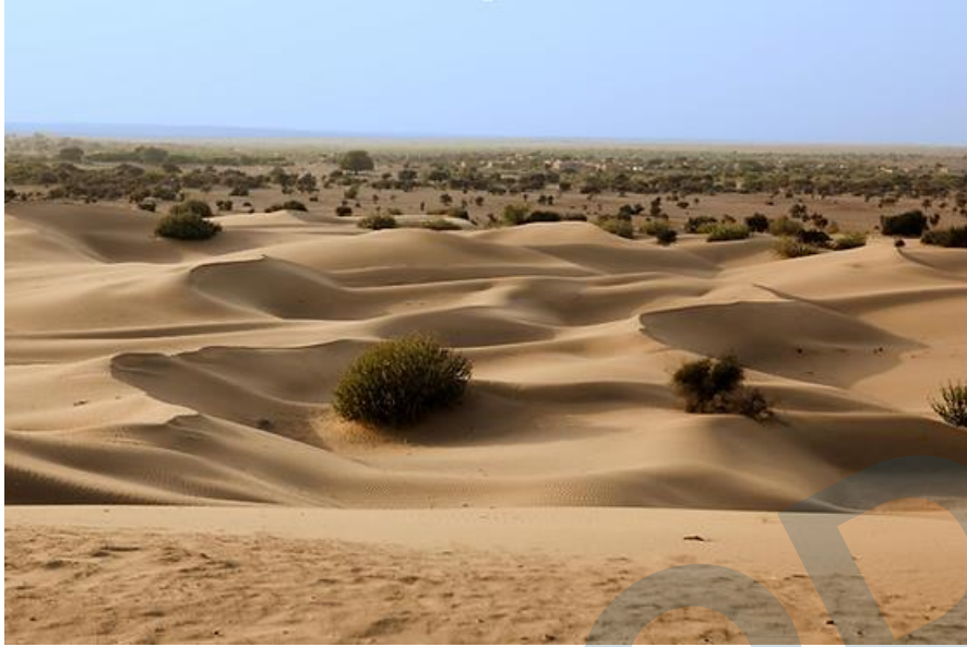
Jaisalmer desert experience